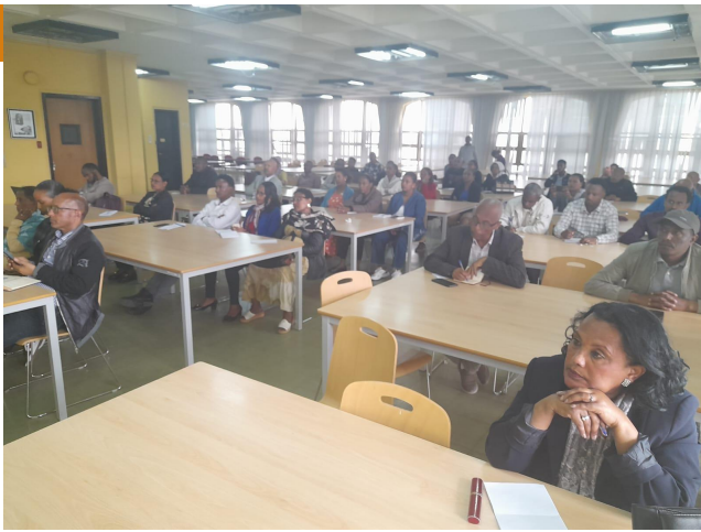
Ethiopia University Librarians and Research Ethics Board members at the Blended webinar in Addis Ababa